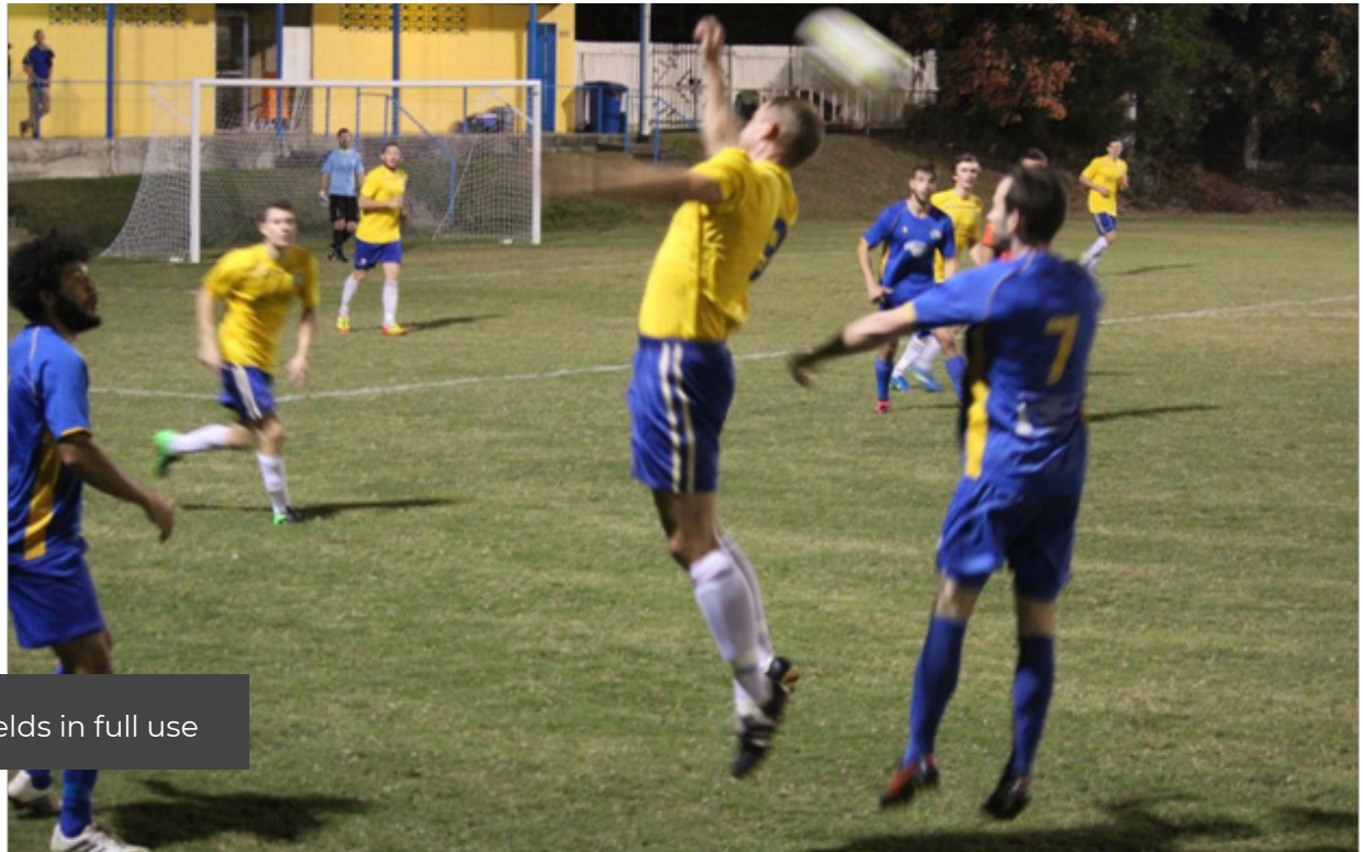
The fields in full use