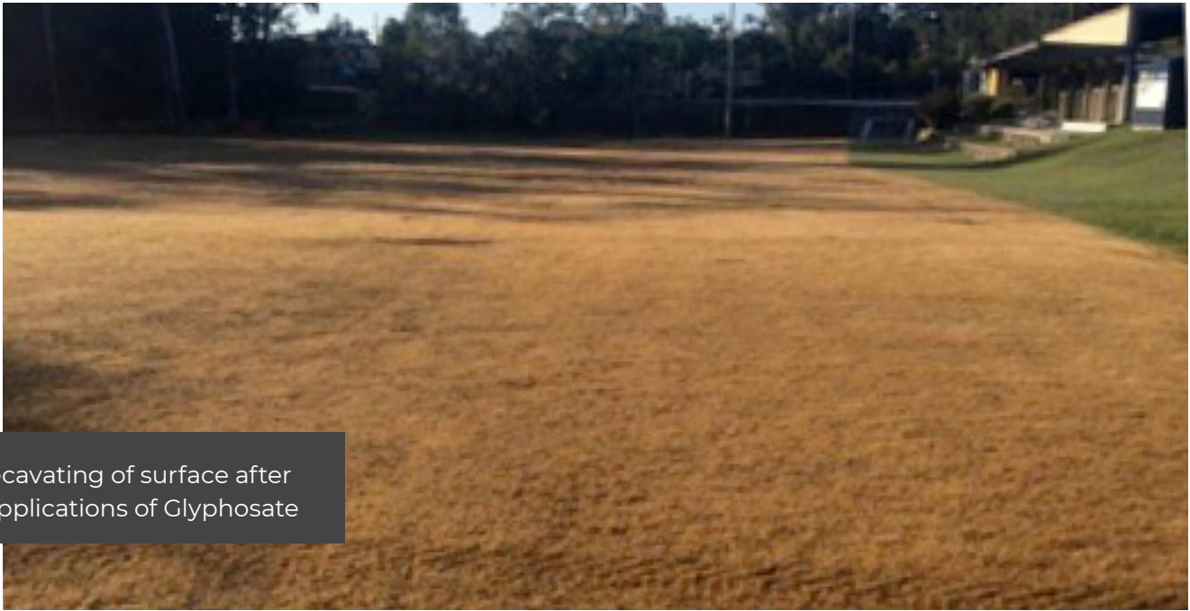
Bleaching of surface after 2 applications of Glyphosate