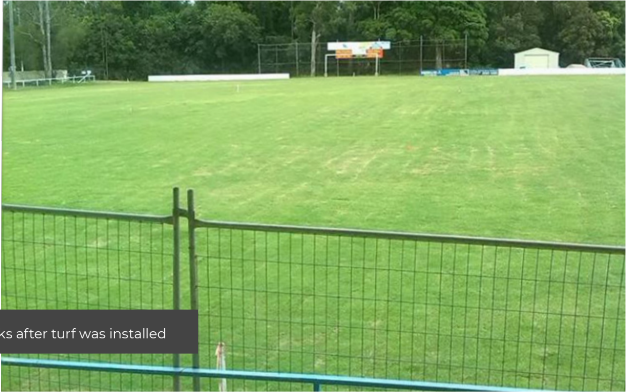
2 weeks after turf was installed