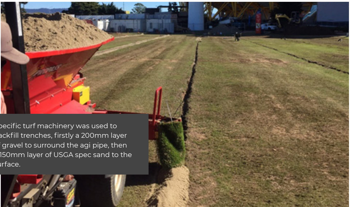
Specific turf machinery was used to backfill trenches, firstly a 200mm layer of gravel to surround the agi pipe, then a 150mm layer of USGA spec sand to the surface.