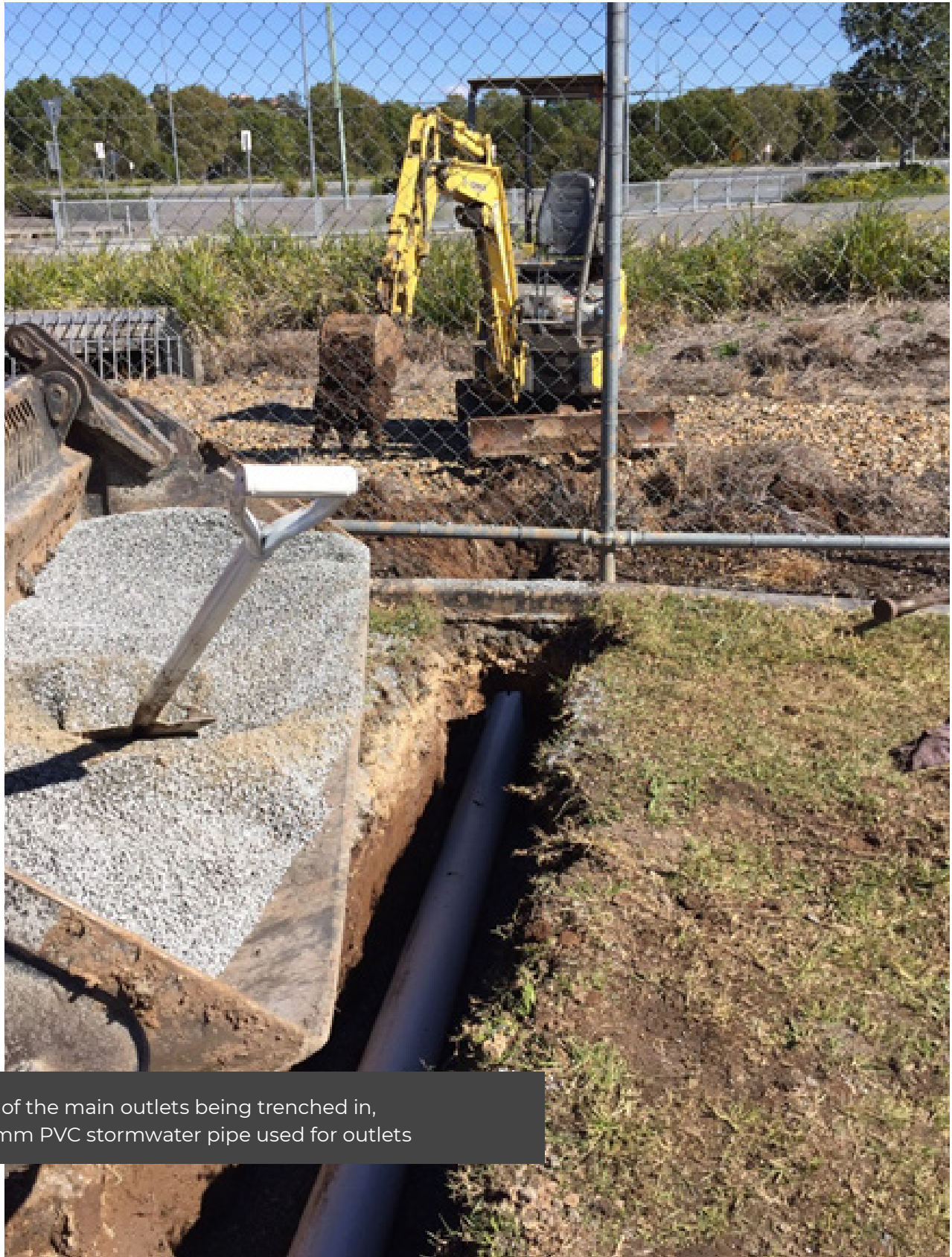
One of the main outlets being trenched in, 200mm PVC stormwater pipe used for outlets