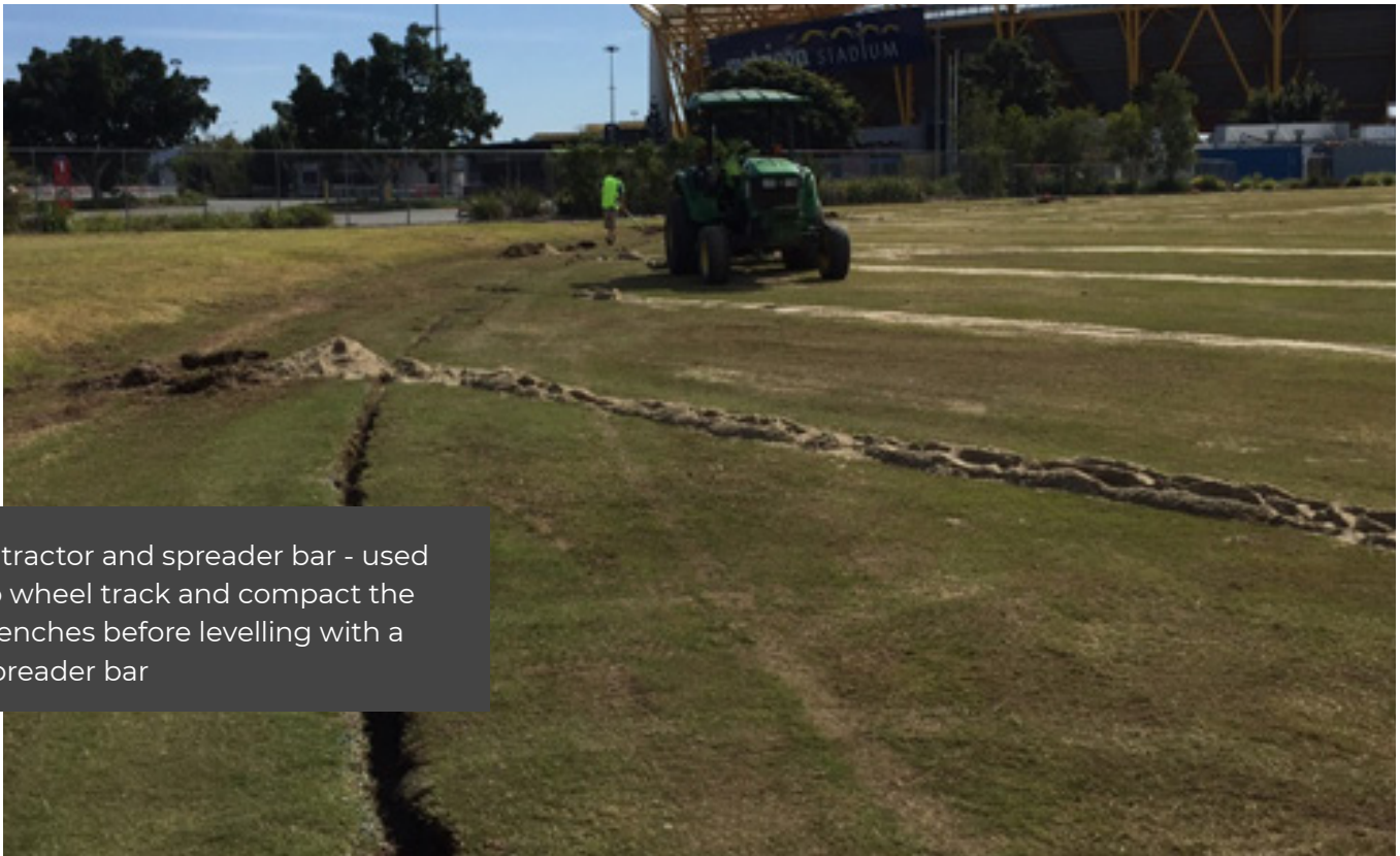
A tractor and spreader bar - used to wheel track and compact the trenches before levelling with a spreader bar