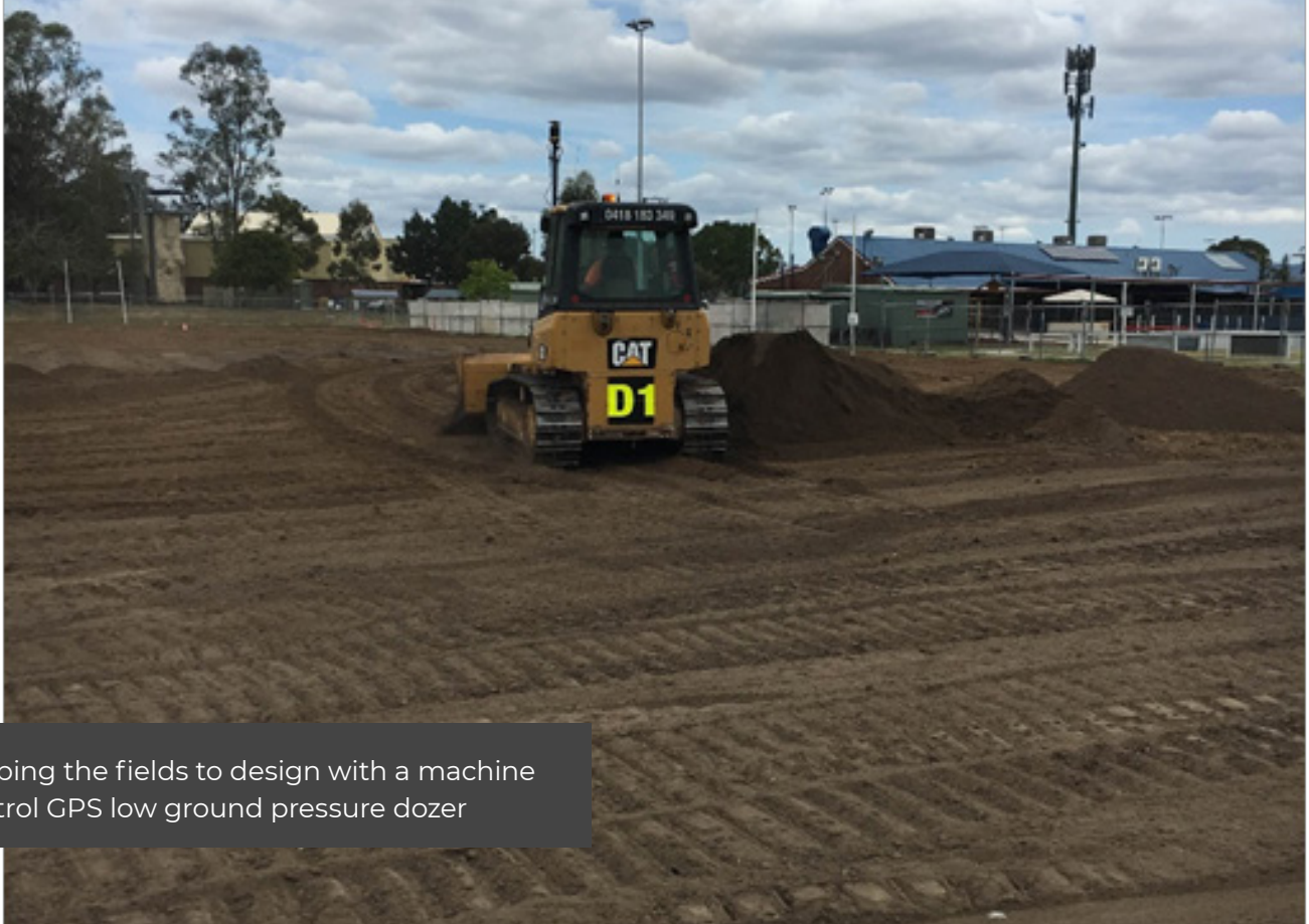
Shaping the fields to design with a machine control GPS low ground pressure dozer