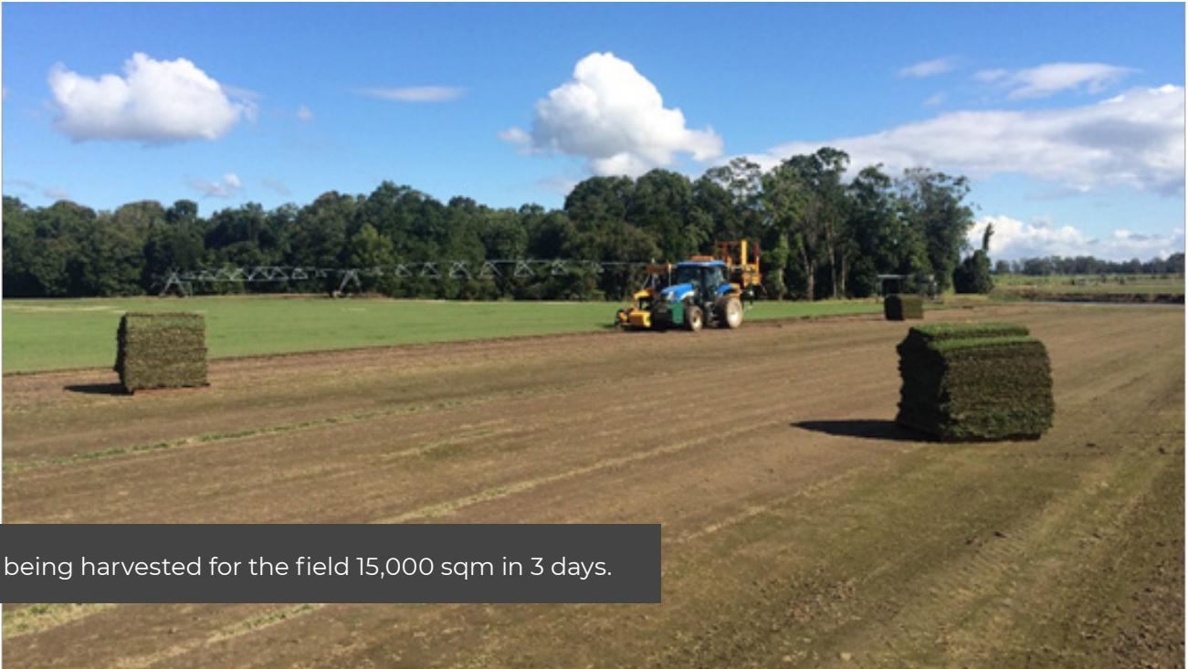
Turf being harvested for the field 15,000 sqm in 3 days.